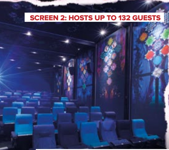
SCREEN 2: HOSTS UP TO 132 GUESTS