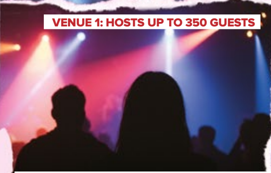
VENUE 1: HOSTS UP TO 350 GUESTS